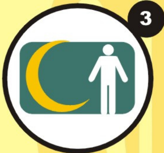
Frequent urination, especially at night