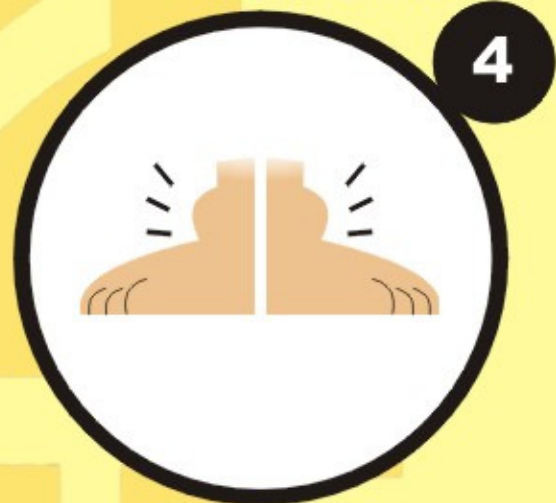
Swelling of ankles or swelling around eyes