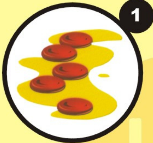
Blood in the urine