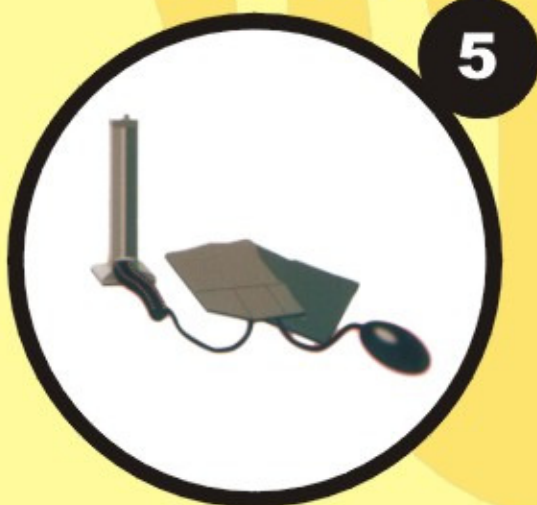
High blood pressure