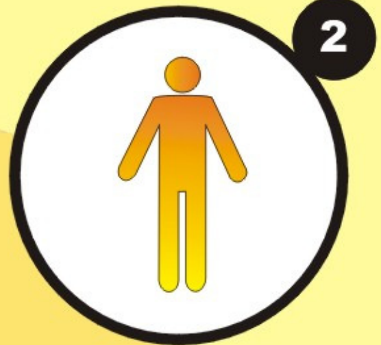
Pain or burning sensation when passing urine